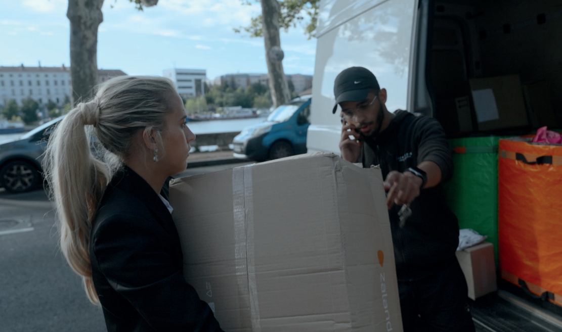
SOCIAL ISSUES • POLITICS