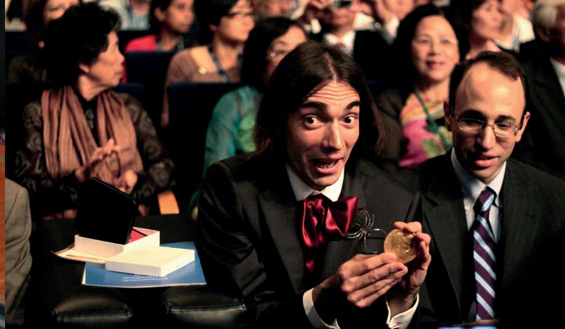
EDUCATION • SOCIAL ISSUES